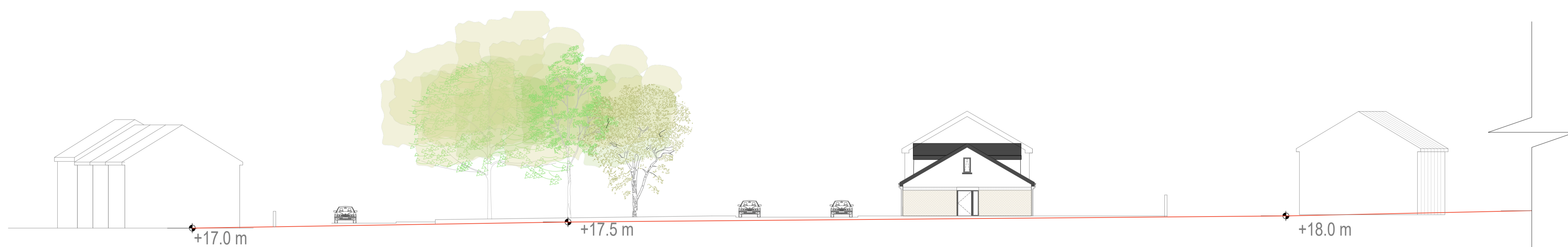
C-C ELEVATIONS- PART 1